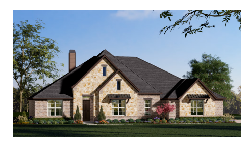
3141 B with Stone