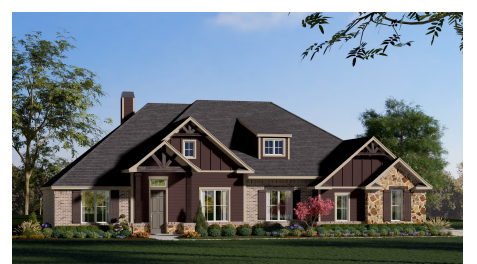
3141 C with Stone