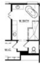
OPT. LUXURY MASTER BATHROOM

In a continuing effort to improve our products and communities, Antares Homes may (in its sole and exclusive discretion and without creating any obligation or notice) abandon, change, or otherwise modify plans, pricing, included features, home site availability, terms, etc. All images, renderings, dimensions, depictions or descriptions of home designs and layouts being offered are for representational and informational purposes only and may vary from the homes being built or completed improvements. All dimensions and designs are subject to field variations and modifications. © 2021 Antares Homes.