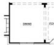
OPT. DINING ILO BEDROOM #4