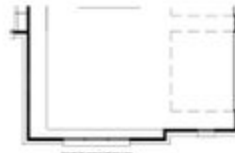
3RD CAR GARAGE OPT. 'A'