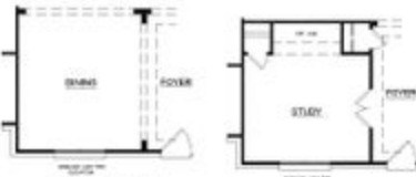
OPT. DINING ILO BEDROOM #4