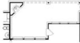
OPT. FIREPLACE AT COVERED PATIO #2