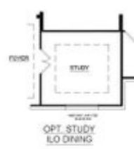
OPT. STUDY ILO DINING