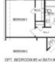
OPT. BEDROOM #5 w/ BATH #3 ILO FLEX ROOM w/ POWDER