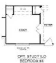
OPT. STUDY ILO BEDROOM #4