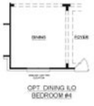
OPT. DINING ILO BEDROOM #4