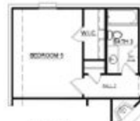
OPT. BEDROOM #5 w/ BATH #3 ILO FLEX ROOM w/ POWDER