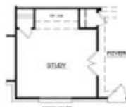
OPT. STUDY ILO BEDROOM #4