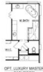
OPT. LUXURY MASTER BATHROOM

In a continuing effort to improve our products and communities, Antares Homes may (in its sole and exclusive discretion and without creating any obligation or notice) abandon, change, or otherwise modify plans, pricing, included features, home size availability terms, etc. All images, renderings, dimensions, depictions or descriptions of home designs and layouts being offered are for representational and informational purposes only and may vary from the homes being built or completed improvements. All dimensions and designs are subject to field variations and modifications. © 2022 Antares Homes.