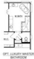
OPT. LUXURY MASTER BATHROOM

In a continuing effort to improve our products and communities, Antares Homes may (in its sole and exclusive discretion and without creating any obligation or notice) abandon, change, or otherwise modify plans, pricing, included features, home size availability terms, etc. All images, renderings, dimensions, depictions or descriptions of home designs and layouts being offered are for representational and informational purposes only and may vary from the homes being built or completed improvements. All dimensions and designs are subject to field variations and modifications. © 2022 Antares Homes.