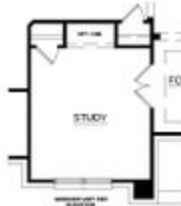
OPT. STUDY I/O BEDROOM #4