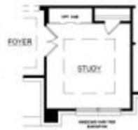
OPT. STUDY I/O DINING