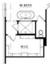
OPT. LUXURY MASTER BATHROOM