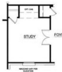
OPT. STUDY I/O BEDROOM #4