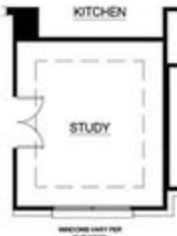
OPT. STUDY I/O DINING