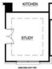
OPT. STUDY I/O DINING