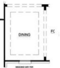
OPT. DINING I/O BEDROOM #4