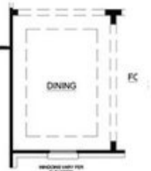
OPT. DINING I/O BEDROOM #4