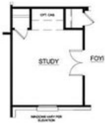
OPT. STUDY I/O BEDROOM #4