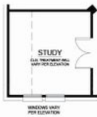
OPT. STUDY ILO FLEX ROOM